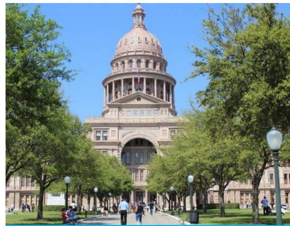
Visit the Texas State Capitol